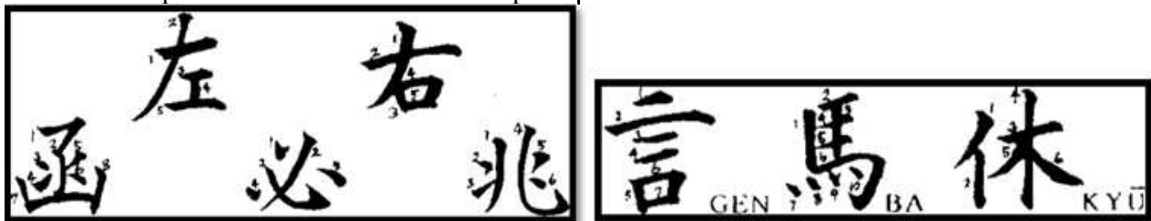
Figure (2) Kanji Calligraphy

The art of calligraphy has evolved since ancient times in Southeast Asian countries that use Chinese kanji. Japan has developed this art and linked it to its Kanan-derived Kana script, and in addition to its unique touches, many new Japanese line art schools were born.(16)