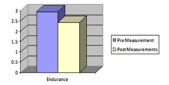
Figure~(2) The significance of the differences between the mean and the remote measurement of the experimental group of tolerance and the coefficient of the efficiency of the skill performance

Table (4) shows that the highest percentage of improvement was for the endurance behavior (17.5%) and the lowest percentage of improvement was the defensive behavior (11.2%).