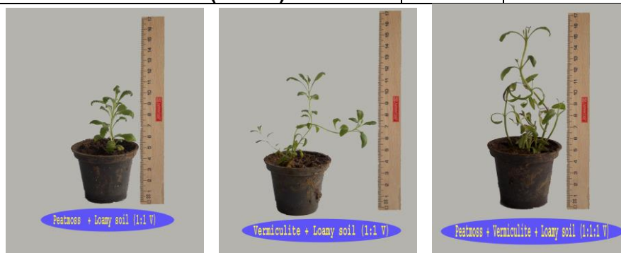
Photo (4): Effect of the transplanting media on increase in shoots length (cm).