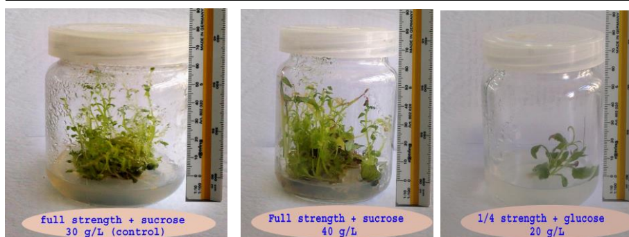
Photo (2): Effect of the interaction between media strength, sugar (type and concentration) on shoots number.

Full strength medium supplemented with sucrose at 20 g/L induced significantly a highest value of 45.00mm when compared with all of the other interactions except for explants cultured on medium at 3/4 strength fortified with sucrose at the same concentration, as it was 41.17mm. One fourth strength media supplemented with glucose at 20, 30 and 40 g/L significantly measured the shortest values of 15.40, 10.73 and 7.92mm, respectively when compared with most of the other treatments. In general, it was noticed that the sugar concentration was shoots length dependent, as increasing the sugar concentration, decreased the shoots length at most of the tested media