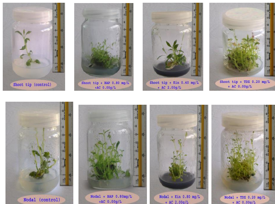
Photo (1): Effect of explant type, cytokinin type, cytokinin and AC concentrations on average shoots number of lavender plantlets.

2.00 g/L., respectively. This finding coincided with (Begum et al. , 2002) on Ocimum basilicum . as they found that nodal explant was significantly higher than shoot tip one in this shoot characteristic.