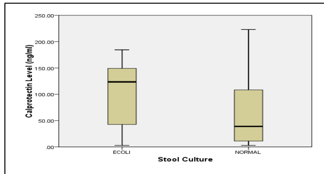
Figure (2): comparison between normal and E-coli stool culture results as regard the fecal calprotectin level.

There was no statistically significant association between feeding type and E coli infection (table 3) or feeding type and fecal calprotectin level (table 4).