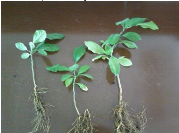
Fig. 2. A normal complete plant differentiation from anther-derived calluses of Citrus volkameriana

of anthers that develop than a 0.0 mg/l.