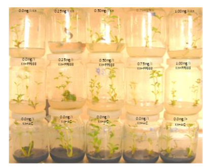
Fig.(2): Effect of balance among Kn concentrations, anti gebrillen (PP333) or activated charcoal on Stevia rebaudiana Bertoni during establishment stage.