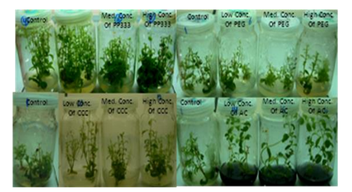
Fig. (3): Effect of various concentrations of growth retardant (PP<sub>333</sub>, CCC or PEG) or AC on multiplication parameters of Stevia rebaudiana Bertoni.

Concerning data discussed shoot length; data revealed that the highest shoot length was obtained on AC followed by PP<sub>333</sub>, CCC and PEG (8.72, 6.14, 5.35 and 4.83cm, respectively). Regarding concentrations of growth retardant and AC, data cleared that no significant differences was observed between high and mediate concentrations of growth retardant and control, while low concentration possessed significant decreasing of shoot length (5.83cm). Inter action data cleared that AC at high concentration, possessed the highest shoot length (10.66cm) while the lowest shoot length was obtained on MS medium supplemented with PEG at mediate concentration (3.66cm).