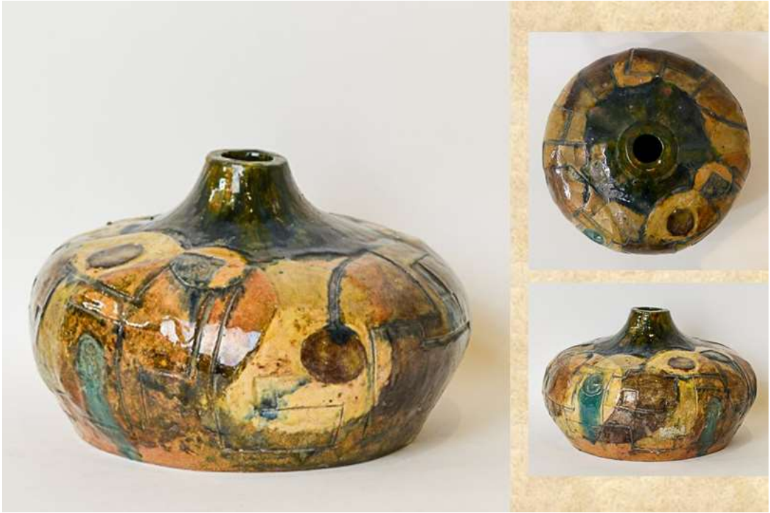
Fig. 3. Untitled Vessel, Stoneware Ceramic, H. 20 x W. 31 x Ø. 32 cm, 1965. Museum of Modern Art, Cairo. Digitized Archive Code: mohamedtaha-UP-4-024A-2 6632