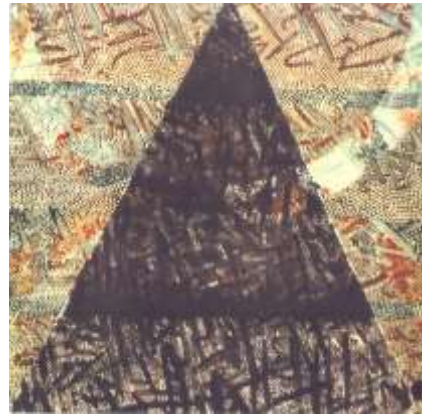
Fig. 19 @mth