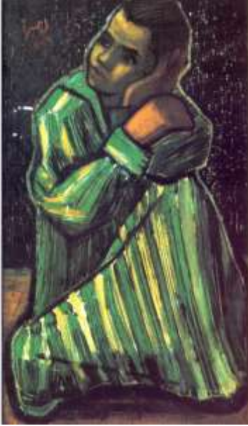
Fig. 12 @mth