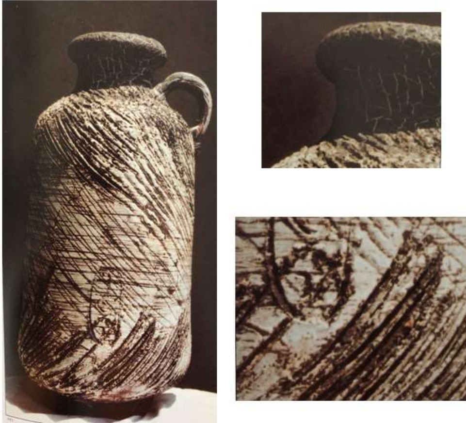
Fig.5. Untitled. Stoneware ceramic, white glaze, 1972. H. 49cm x 24 cm, Museum of Modern Art, Cairo Digitized Archive Code: mohamedtaha-POT-6-044