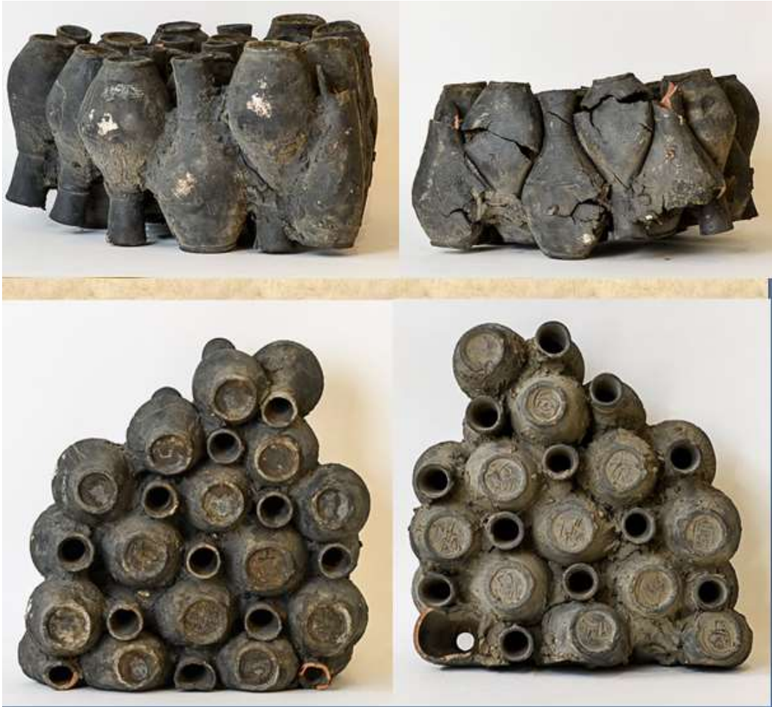
Fig. 4. Drinking Pot (Qualla), Black glaze, H. 29 x W. 42 x Ø. 40 cm, 1972. Museum of Modern Art, Cairo