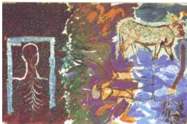
Fig. 24 @mth