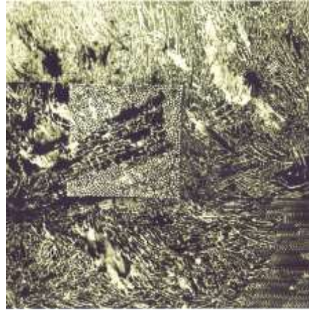
Fig. 21 @mth