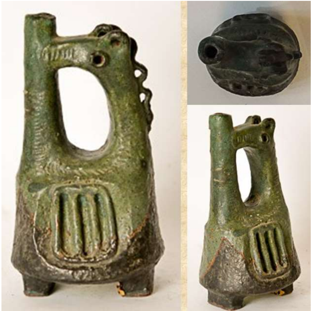
Fig. (1) Horse,1958, Stoneware with engobe and glaze, H. 25 x W. 13.5 cm, Museum of Modern Egyptian Art, (no.6175) Digitized Archive Code: mohamedtaha-POT-3-006B 6175