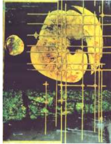
Fig. 17 @mth