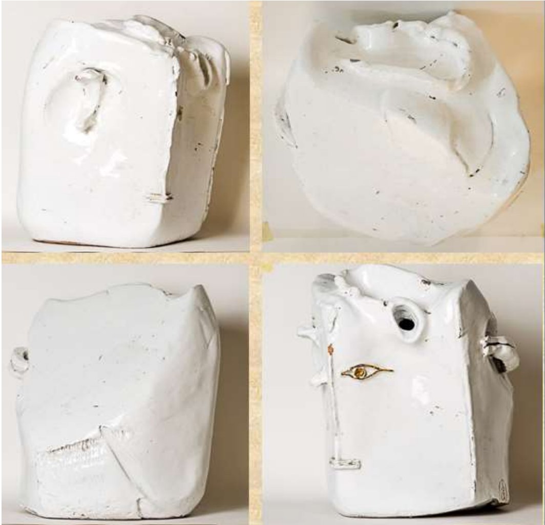
Fig. 11. Untitled, White glazed ceramic, H. 50 x w. 42 x Ø. 46 cm, 1985.