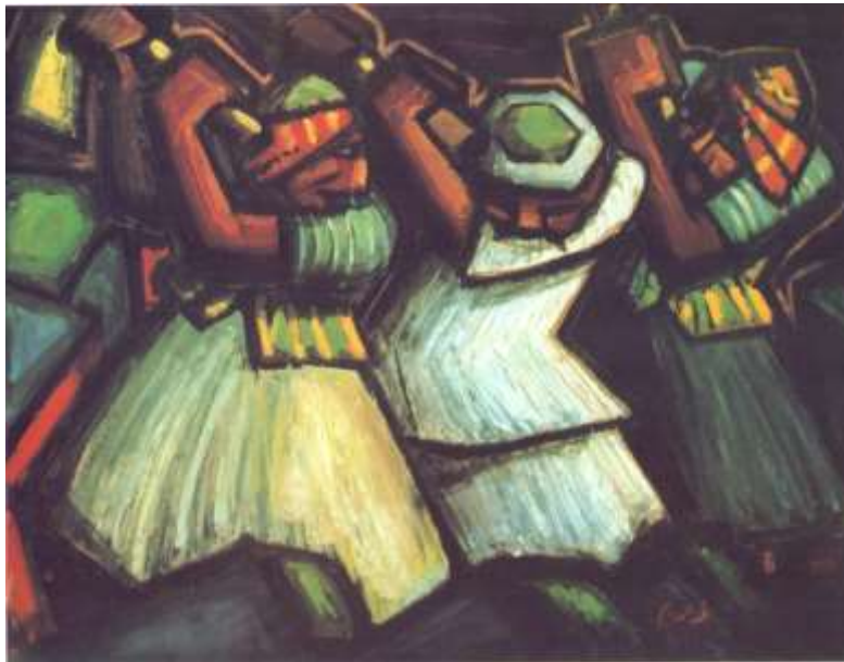
Fig. 15 @mth