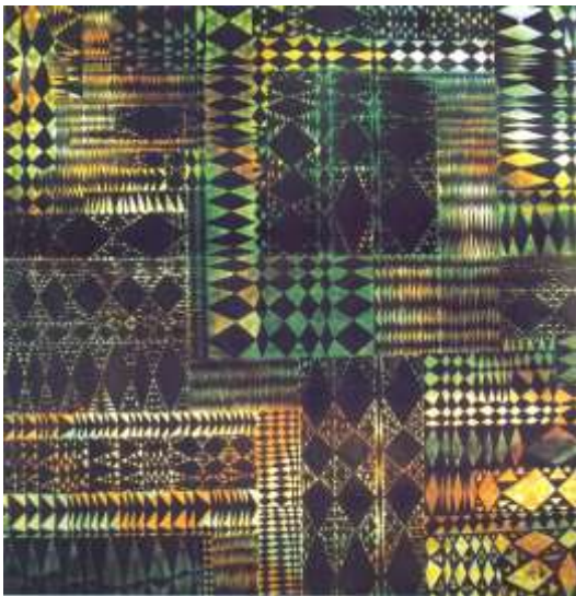
Fig. 18 @mth