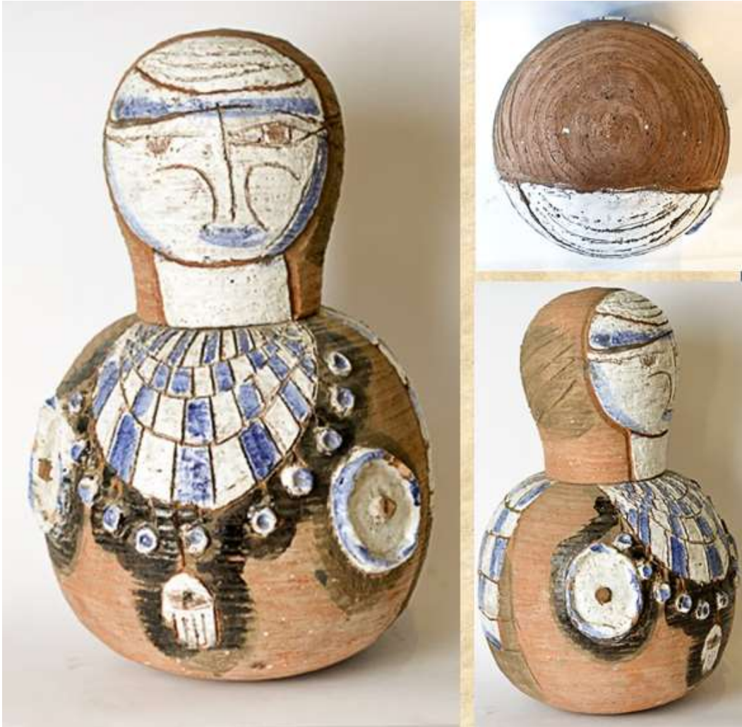
Fig. 8. Untitled, Stoneware ceramic, H. 60 x w. 36 x Ø. 41.5 cm,1980. Museum of Modern Art, Cairo Digitized Archive Code: mohamedtaha-POT-7-001 11233