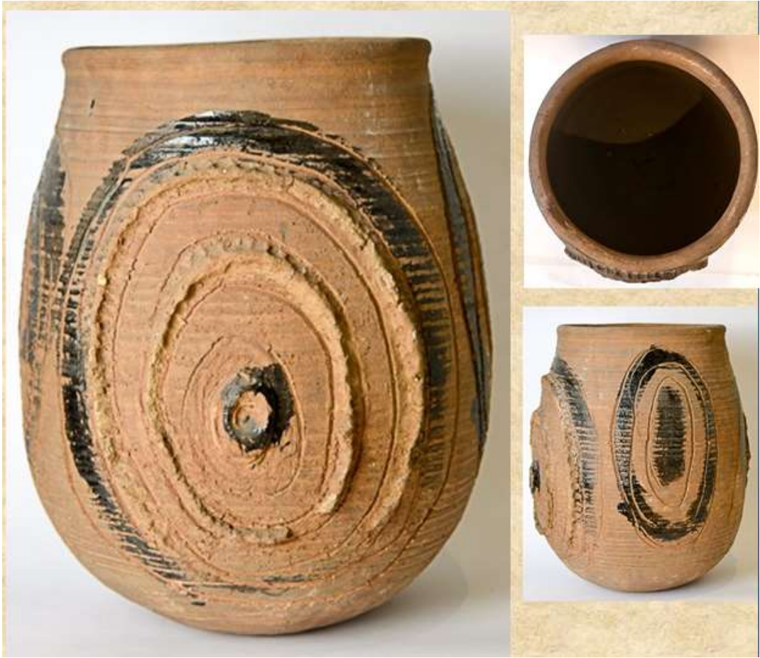
Fig. 7. Untitled, Stoneware ceramic, H. 50 x w. 45 x Ø. 37 cm, 1980. Museum of Modern Art, Cairo Digitized Archive Code: mohamedtaha- POT-6-045 Unregistered