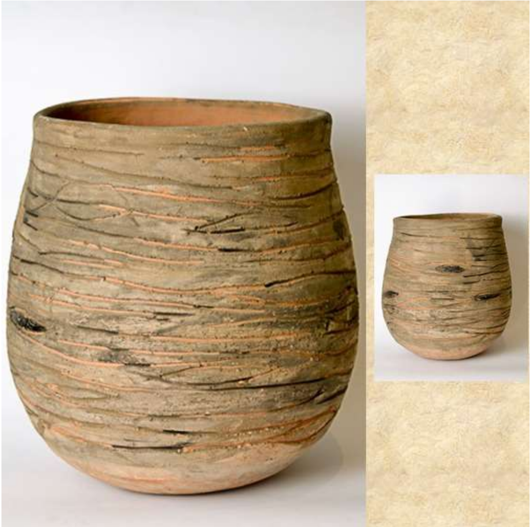
Fig. 6. Untitled. Stoneware ceramic, H. 43 x W. 33 x Ø. 36 cm, 1980. Museum of Modern Art, Cairo Digitized Archive Code: mohamedtaha-POT-6-044 Unregistered