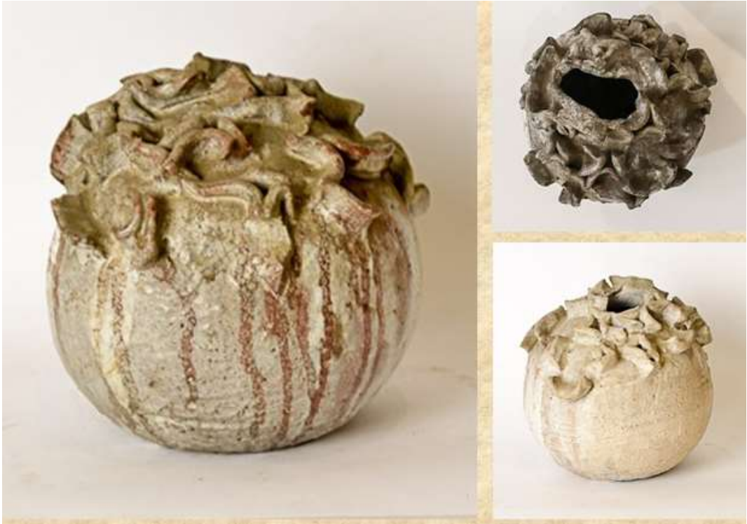
Fig. 10. Untitled, Stoneware ceramic, H. 25 x w. 24 x Ø. 23 cm, 1980. Museum of Modern Art, Cairo Digitized Archive Code: mohamedtaha-POT-6-048 8374