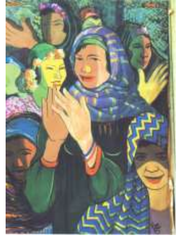
Fig. 14 @mth