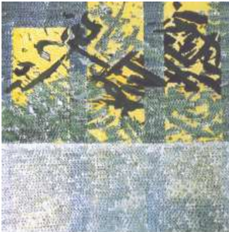
Fig. 22 @mth