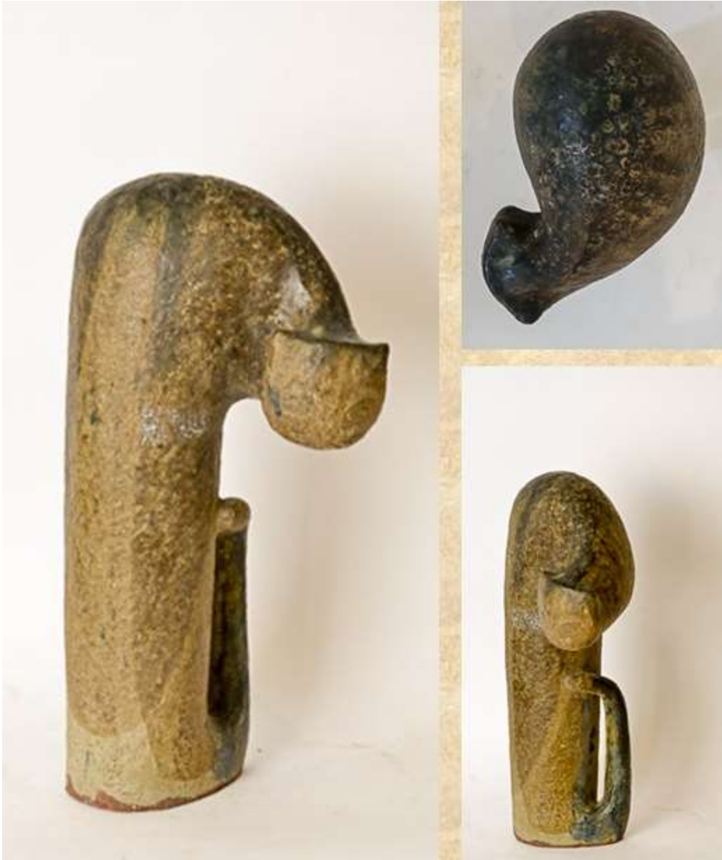
Fig.2. Cat,1958, Stoneware ceramic, H. 41 x w. 25 cm, Museum of Modern Art, Cairo (no.5922)

Digitized Archive Code: mohamedtaha-SO-3-007 5922