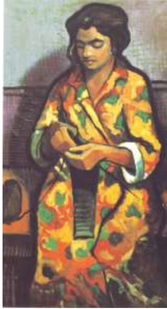
Fig. 13 @mth