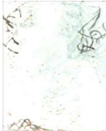
Fig. 23 @mth