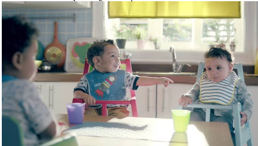
Fig (1) Screenshot of Juhayna “Dondoo” Ad.

Juhayna, known to be the leading national dairy products company, produced a campaign during Ramadan 2016, promoting its milk products. The ad featured toddlers talking, comparing the bottled milk to mother’s breast milk. The dialogue has been perceived as having sexual innuendos, as one of the toddlers mentions that “I want the Dondoo.. I will never forget the Dondoo”. While “Dondoo” has no meaning in the Arabic language, it was used to refer to women’s body parts.