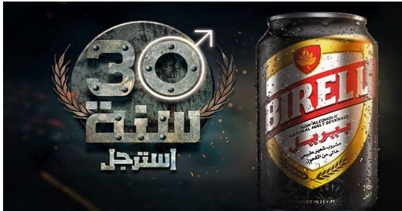
Fig (3) Birell ad stating “30 years of masculinity... be a man”