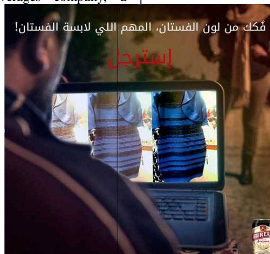
Fig(2) Birell ad showing a man seen looking at a black and blue woman dress that was highly shared on social media, the ad states "forget about the color of the dress, focus on the body wearing it"

In the 2010 ads, the ads depict women constant whiners and naggers, the ads slogan states that "being a man is not easy, be a man, drink Birell". In the 2012 Ramadan ads, Birell declares that men should not be sitting with crossed legs like women, and men should never be sensitive or cry, again ending with the same slogan. The whole campaign was banned in 2016, being considered as a sexist in content, containing strong ideas of sexual innuendos, violating public morals. The campaign's Copywriter states that it is the problem of the society how they perceive the advertising ideas; the society are always lending themselves to being macho and sexiest, the campaign only reflects the societal standards. The campaign has not violated any morals, based on his opinion. The campaign although banned, has been available on digital media.