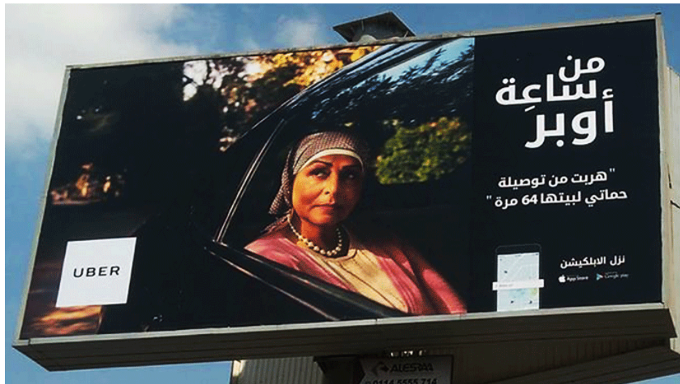
Fig (10) Uber Ad stating “Uber has saved me from driving my mother-in-law home 64 times”