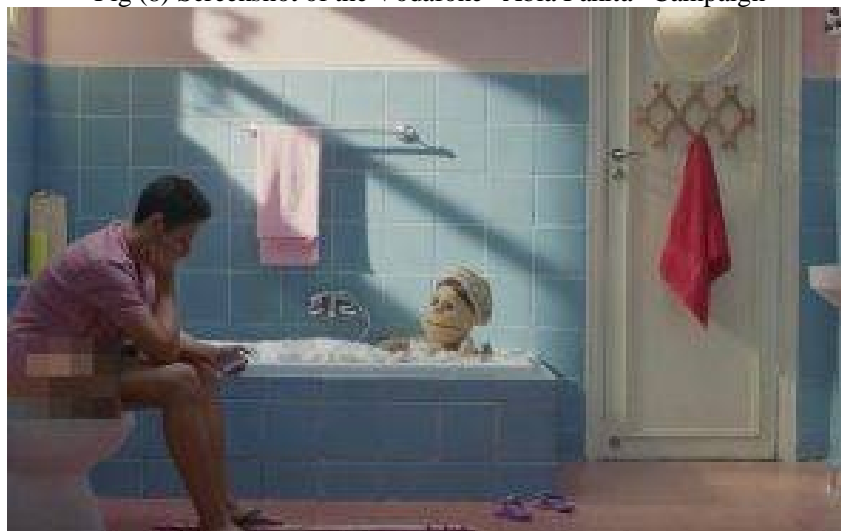
Fig(9) Screenshot of the Vodafone “Abla Fahita” Campaign