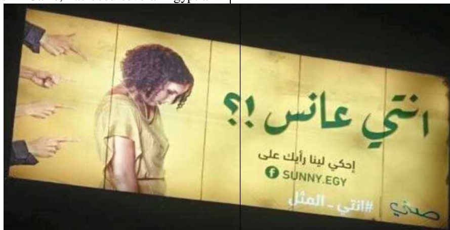
Fig(4) Sunny Billboard reading “Are you a Spinster?.. share your story”