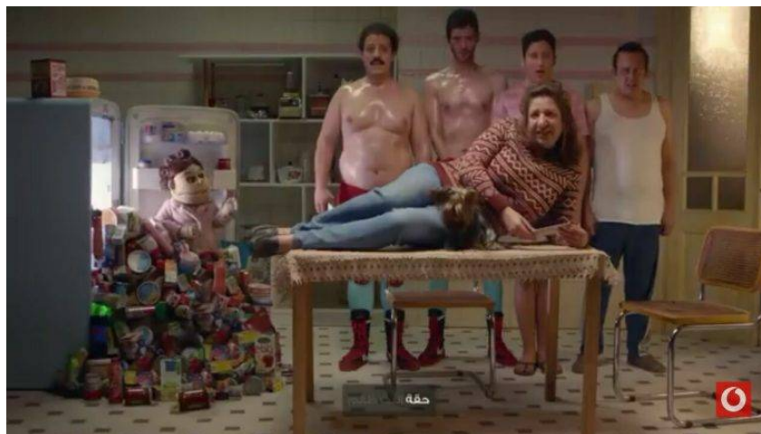
Fig (8) Screenshot of the Vodafone “Abla Fahita” Campaign