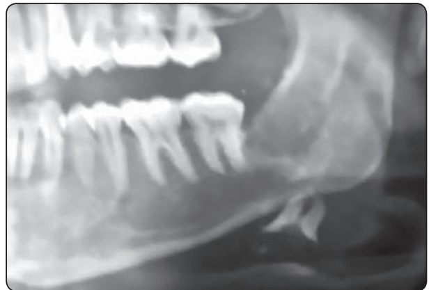
Fig. (1) Panoramic view showing the displaced wisdom roots below inferior border of the mandible

ular region with great care until the root fragment could be visualized with good illumination and support from an extra orally placed finger. With the help of a curette, the roots were pushed outward and removed (Fig. 3).