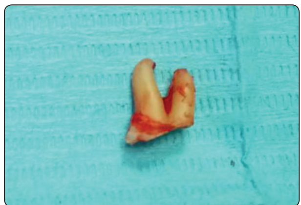
Fig. (3) The diplaced roots were removed