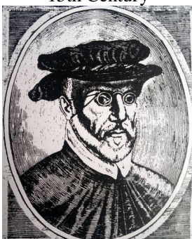
Fig.2 Figure images of J.Rouyer in 1580 with a string of leather spectacles