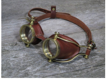
Fig.6 Steam punk style leather frame spectacles

Fig.5 Germany leather frame spectacles in 1600