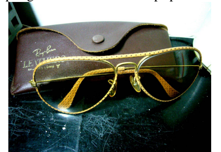
Fig.4 Ray-Ban leather decorative Sunglasses