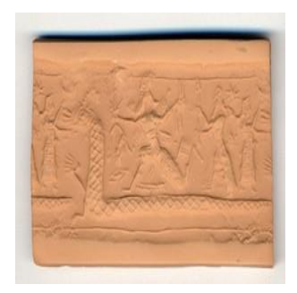
(fig.3)Collon Cylinder Seals V,n 285