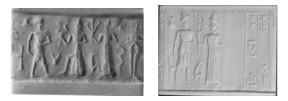
(A) Pittman, Ancient Art,n33 (B)Collon Cylinder Seals III, 240, pl.XX