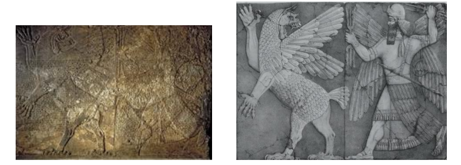
(Fig 2)Neo-Assyrian Relief Nimrud BM n. 124572