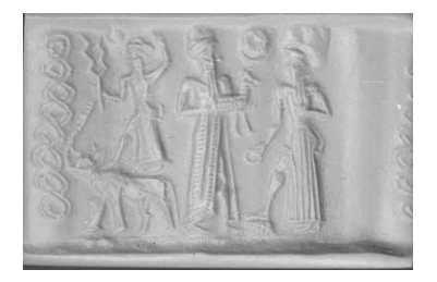
D)Collon Cylinder Seals III ,n 458