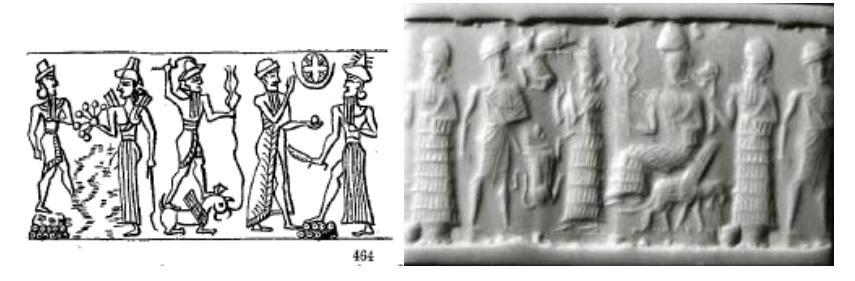
(C)Ward, The seal cylinders, fig. 464 (D)Collon, Cylinder Seals III, 108 pl.XI