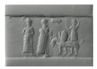
(A)Pittman, Ancient Art,n32