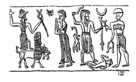
(B) Ward, The seal cylinders, fig. 132