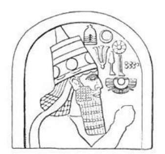
(F) Sargon II.