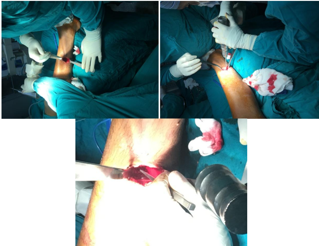
Figure 1; fibular osteotomy, (A) Side of incision for fibular osteotomy,( B) multiple drilling guide ,(C) Small osteotomy for complete fibular osteotomy.

Make multiple drill holes and with thin osteotome and hammer make the osteotomy and translate proximal part of the fibula medially and distal part laterally. The fascia is left open and the skin closed with simple sutures (figure 1).