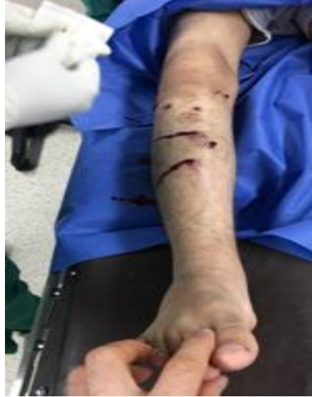
Figure 3; Fixator Removal

The patients were reassessed clinically and by radiographs at 1, 3, 6 and 12 months