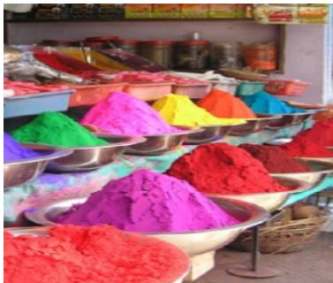
Figure (4) Eco dyes

Natural dyes are dyes primarily obtained from sources found in nature. that a great source for natural dyes can be found right in your own backyard It's not surprising—roots, nuts and flowers are just a few common ways to get many colors like yellow, orange, blue, red, green, brown and grey.