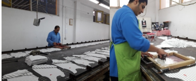
Figure (11) Natural dyes in Nature Tex

The company has 240 employees, beside approx. 60 women working from their homes. Social aspects are of highest priority and exceed the requirements of all regular certifications.