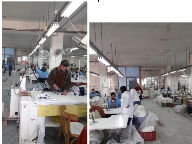
Figure (10) Nature tex factory

Nature Tex has achieved European standards of quality control and is managed according to the quality systems of "ISO 9001", "ISO 14001" and "OHSAS18001" for a safe working environment. All production also runs under the "Demeter" standards for Biodynamic textiles.