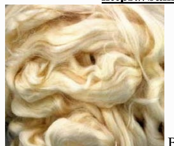
Figure (2) Bamboo plant(a) and fiber (b)