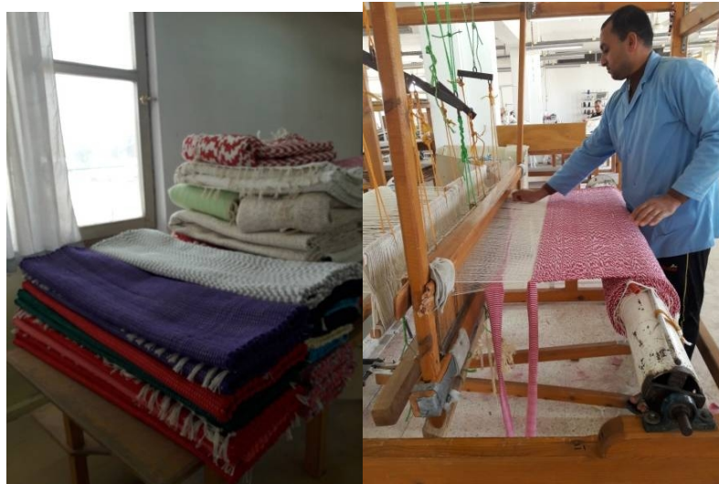
Figure (12) Recycling rugs in Nature tex