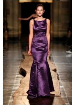
Yves Saint Laurent