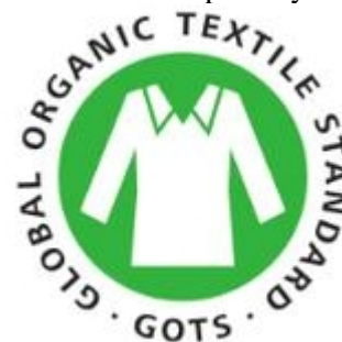
Nature Tex certification – Figure (8)