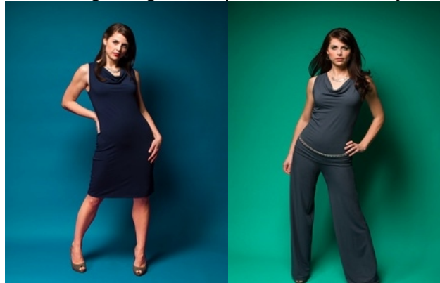
A Canadian brand, Miik made from bamboo – Figure (3)

Bamboo fabric can be made in one of two ways – chemically or mechanically. The chemical process has been met with much resistance from sustainable fashion experts because this process requires toxic chemicals. These chemicals, sodium hydroxide and carbon disulfide, change the genetic