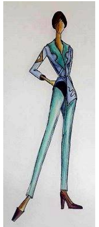
Fig (9) Figs from [9-11] illustrated the inspiration that based on the diverse artistic style in Fig (6) as it focus dramatically on the color element and the element of line as showed in the outer shape of the models (silhoute) and followed by the shape element which appeared in the decorative additions models