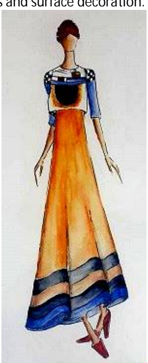
Fig (15) Fig (16) Figs from [15- 17] describe the inspiration that based on the diverse artistic style in Fig (8), as it focus on line and color elements as printed trappings on the models.

The questionnaire was distributed to ten arbitrators' specialists in the field of fashion in Home Economics Department of the Faculty of Specific Education and Department of clothing & textiles of the Faculty of Applied Arts – Damietta University and asked them the following: