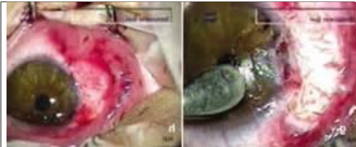
Figure 1 B : The target plane exposing all the tortuous episcleral blood vessels.

the underling limbus and episclera using Wescott's scissors . Subconjunctival fibrous tissue was removed completely in an area much greater than the pterygium body itself. The target plane was reached when exposing all the tortuous episcleral blood vessels( figure 1B ) , Any abnormal scars on the corneal surface were removed with crescent knife, application of MMC 0.02% for 2 minutes to bare sclera area