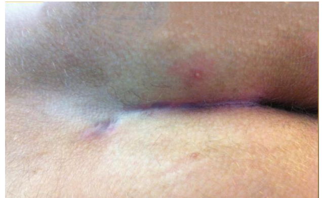
Fig.5: Three months Post operative Pilonidoplasty.