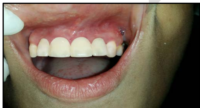
Figure 5: Placement of abutment and final prosthesis.