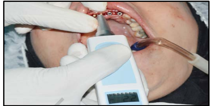
Figure 3: Measuring primary stability using Periotest™ device.

Diclofenac potassium 50mg tablets (Cataflam®50mg, Novartis Pharmaceuticals Corporation, Basel, Switzerland) 1 tablet 3 times daily after meals for 4 days.