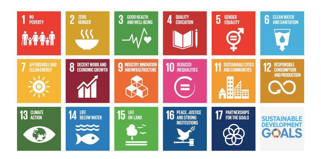
Figure 2: United Nations' Sustainable Development Goals.

Additionally, we divided the SDGs into the three following categories: Society, Economy and Environment , consistent with the classification which be discussed in [8][9]. The SDGs