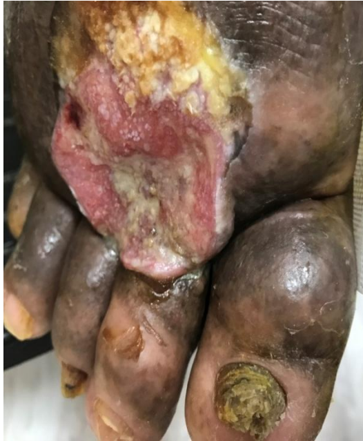
Figure 1. Fungating ulcer measuring 6X6 cm on the dorsum of the right foot.