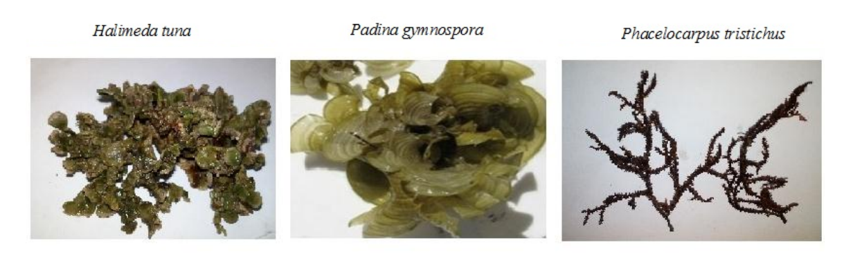
Figure 1: Marine algae collected from the Red Sea (Qusier and Marsa-Allam, Egypt).