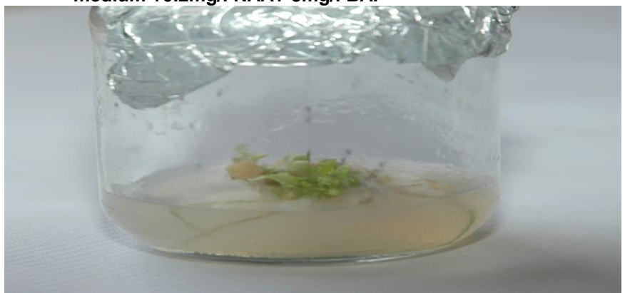
Fig.(2): Plant regeneration with rooting obtained from N.A.51 hypocotyl on MS medium +0.2mg/l NAA+ 3mg/l BAP

Results in Table 2 showed that the genotypes showed significant effect on plant regeneration. Significant value of plant regeneration recorded for N.A.51 (2.74 plant per 5 calluses) while the lowest value of plant regeneration obtained from Sarow 4 cultivar. The growth regulators had significant effect on plant regeneration. The highest values recorded when MS medium with 0.2 mg/l NAA + 2 or 3 mg/l BAP were used (3.0 and 2.98 plant per 5 calluses) while the lowest value of plant regeneration recorded on MS medium with 0.2 mg/l NAA+ 1 mg/l BAP. Explants had significant effects on plant regeneration. The cotyledons explants gave the highest value of plant regeneration compared with the hypocotyle (2.36 per 5 calluses) fig.(2) in the same time roots did not gave any plants.