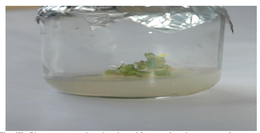
Fig. (5): Plant regeneration developed from uninuclate stage of sarow- 4 microspore