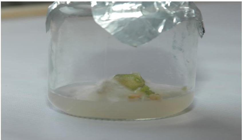
Fig. (1): Plant regeneration obtained from N.A.355 Cotyledons on MS medium +0.2mg/l NAA+ 3mg/l BAP