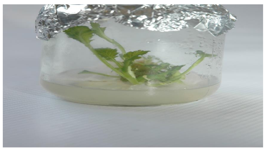
Fig.(6): Plant regeneration from anthers of Sarow- 6

Also, the interaction between genotypes and microspore stage had significant effect on plant regeneration from anthers. The highest percent of plant regeneration recorded when N.A 355 cultured in uninucleate stage (38.335%). While the lowest value (17.085%) of plant regeneration recorded for Pactol cultivar cultured on tetrad stages.