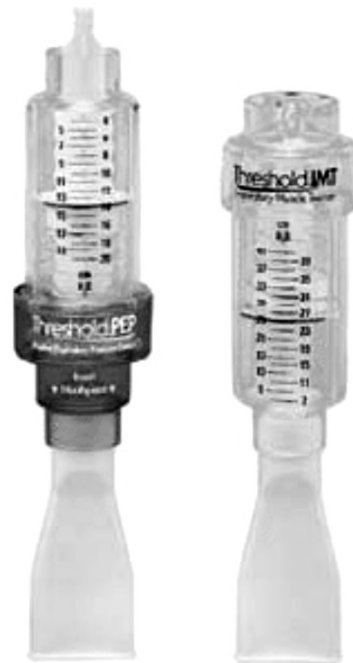
Fig. (1): IMT (Inspiratory Muscle Trainer).

The Threshold® IMT (Respironics Inc., Murrysville, PA, USA) is an inspiratory muscle trainer, which has been widely used with various health conditions. This device contains, at its end, a valve closed by the positive pressure of a spring, which can be graded from 9 to 41cm H 2 O and allows resistance changes by 2cm H 2 O increments. The Threshold IMT has a one-way spring-loaded valve, that closes during inspiration and requires that participants inhale hard enough, to open the valve and let the air enter. This device provides constant pressure for inspiratory muscle training, regardless of how quickly or slowly the participants breathe, and the optimal loading pressure can be adjusted,