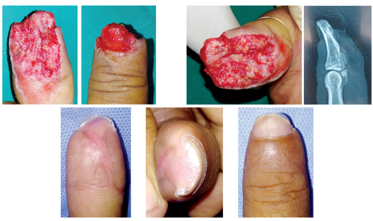
Fig. (1): Before and 9 months after conservative treatment of amputated right thumb finger tip.

50% of patients expressed good aesthetic results, 40% of patients had accepted aesthetic results, and 10% had poor aesthetic results.