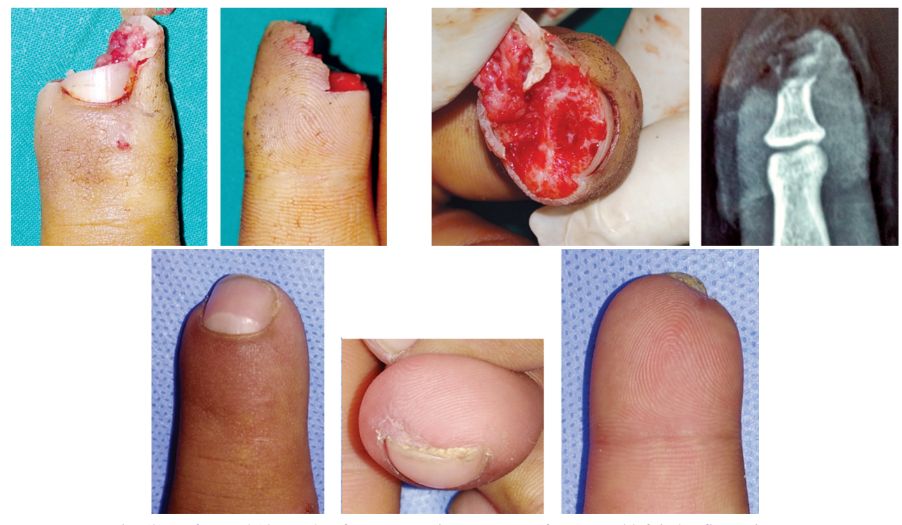
Fig. (2): Before and 10 months after conservative treatment of amputated left index finger tip.