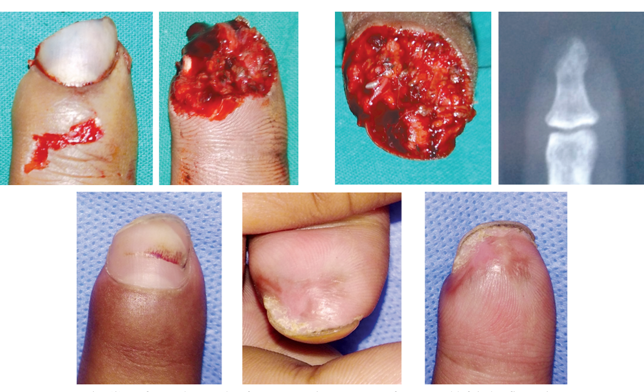
Fig. (3): Before and 9 months after conservative treatment of amputated left index finger tip.