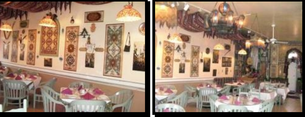
Figures 1: The interior environment of Layalina Restaurant.

encouraged both group and personal activities,