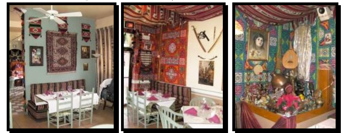
Figures 2: The Arabic features in Layalina Restaurant

Convenience. The availability of hookah and cigarette smoking indoors after 10 o'clock at night was an additional attraction of Layalina. The restaurant was one of the few places where one could smoke inside since it is banned in most places in the United States. Furthermore, customers appreciate the accessibility of parking. In Arlington, Virginia, parking can be scarce. Thus, meeting this customer needs attracts the targeted patrons to the restaurant.