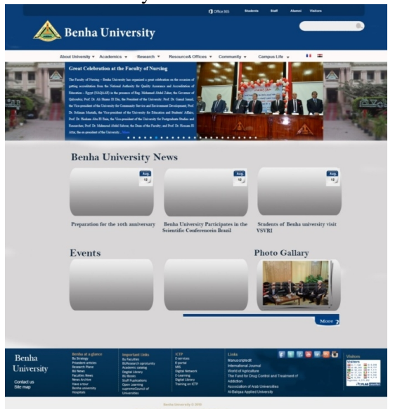
Figure [7] presents our wireframe that should precede visual design step.

7. Navigation as a major usable factor is independent factor by itself but it is expanded in other usability factors.