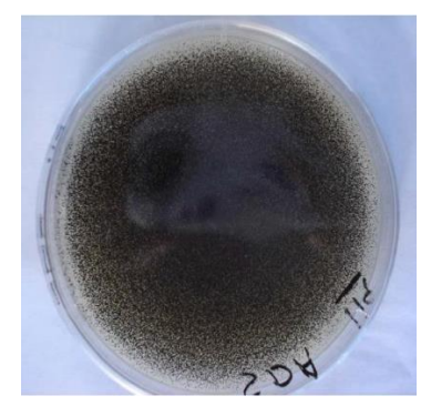
Fig (3): Morphology of Aspergillus Niger culture on Sabouraud's Dextrose Agar medium (from undergoing (chemotherapy patient