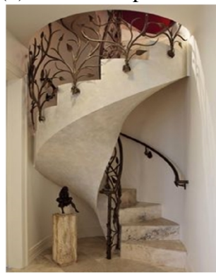
Fig.(9) narrow stairwell (uncomfortable)

The stair rails mistake that you may encounter in a home where a narrow stairwell has made it difficult to move furniture in or out of a room. Someone removes the railing to move large items up or down the stairs.