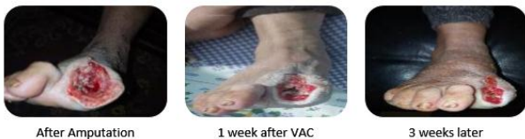
Figure (3): Decreased wound surface area after VAC therapy.

Wound size was measured at initial presentation and then after treatment. Our main end point of wound healing/reduction in size was compared in both groups using Chi-square test. Before treatment, the mean surface area of wounds in the NPWT group was 40.44cm 2 , the Conventional treatment 38.52cm 2 . After wound management, mean surface area of the diabetic wounds was 36.08 ± 2.56 cm 2 in the NPWT group and 37.63 ± 2.86 cm 2 in the Conventional treatment. This was a statistically significant difference (P < 0.05).