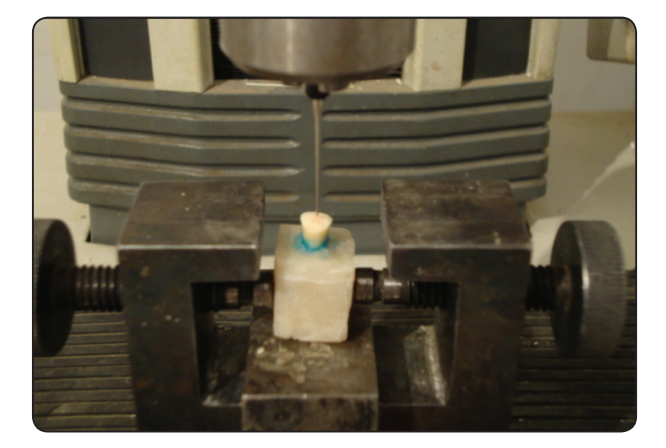
Fig. (1) Lloyd instrument testing machine (UK) when applying vertical force through finger plugger to an obturated root canal in composite mold up to fracture.

Lloyd instrumental testing machine (UK) was used to apply vertical forces to the gutta percha in the root canal. Finger plugger size 40 or 60 (Mani, UTSUNOMIYA TOCHIGI, Japan), (40 for 2% taper, 60 for 6% taper) was connected to the machine and adjusted penetrate the root canal with speed of 0.5mm/ min. and to stop penetrating the obturated root canal when it reached 2 mm shorter than working length. The mold was centered under plugger and penetration started with gradual increase of penetration force. The fracture force (N) value was determined from the graph then converted to Kg (Figure 1).