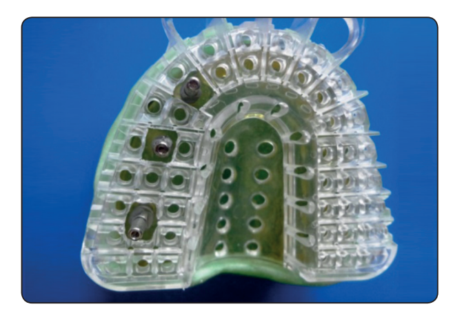
Fig. (2) The ready made tray over the master model with the transfer copings going through the openings.

The ready made tray is formed of panels connected to each other. The panels opposite to the impression transfer copings were removed using cotton plier. Then the trays were checked on the master model with the transfer copings to insure that they were not interfering with the tray during its insertion and removal. ( Figure 2 )