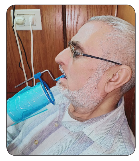
Fig (1): Aiming device carrying bite block with film sensor during exposure.

Radiographic examination of the crystal bone loss around the implant was carried out with film sensor (RVG 5200, Carestream Dental / Kodak. USA software), Aiming device with bite block and digital periapical film sensor inserted inside the patient's mouth then exposure was done using the extension cone parallel technique. Fig (1) and Fig (2) .