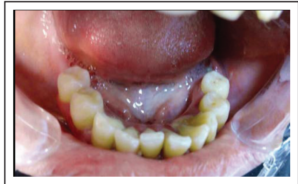
Fig. (1): Mandibular partially edentulous ridges class I.

of 100 N on the desired loading entailed applying a vertical static load of 100 N on the desired loading point the readings were recorded in micro strain units from the multi-channel strain indicator.