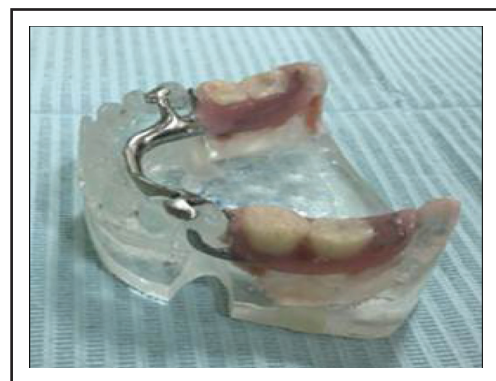
Fig. (3): Final Co-Cr Partial denture.