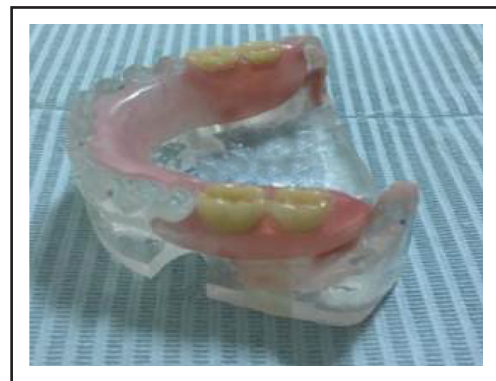
Fig. (2): Final flexible Partial denture.