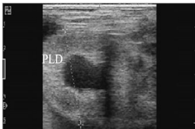
Fig 1. Ultrasonographic estimation of placentome diameter (PLD)

Serial ultrasonographic examinations were then carried out biweekly between days 75 and 146 of pregnancy. The ewes were examined transrectally. The transrectal examination was performed in a standing position using a Pie Medical Scanner (100 LC, The Netherlands) attached with 6/8MHz linear array transducer. The transducer was fitted in a self-manufactured connector to favor its manipulation in the rectum. Diameter of the placentome was taken while it was in a cross section and appeared as a C-shape (Fig.1). At each occasion, two to three placentomes were measured at different area of the uterus.