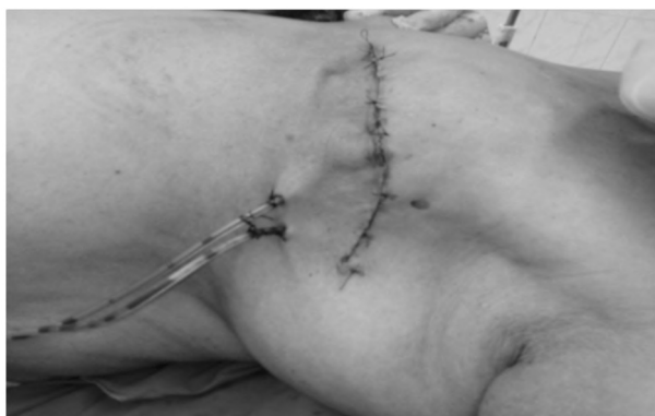
Fig. (1): Illustrating wound post modified radical mastectomy.