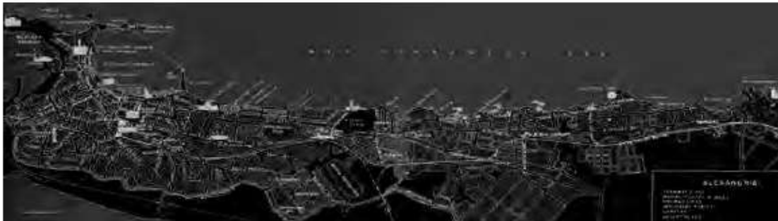
Figure (1): The City of Alexandria, Egypt existing plan 2011

The city has passed through various planning stages in last few decades. As it is considered the second largest city in Egypt after Cairo, it suffered several development pressures which led to the loss of its distinguished urban character. The unique character of the city comes from the various types of medieval architecture buildings which decorates the cityscape. Also the various open spaces which gains its character from either the surrounding buildings or the artwork (Sculptures) which decorates its centers such as Al-Mansheyya Square, Misr Railway station Square, Saad Zaghlol Square.