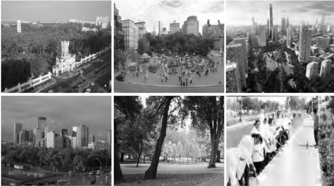
Figure (7) Various themes of Urban Landscape Strategy management of parks and public spaces, conservation of historic landscapes, providing nature in the city and above all enhancing public participation