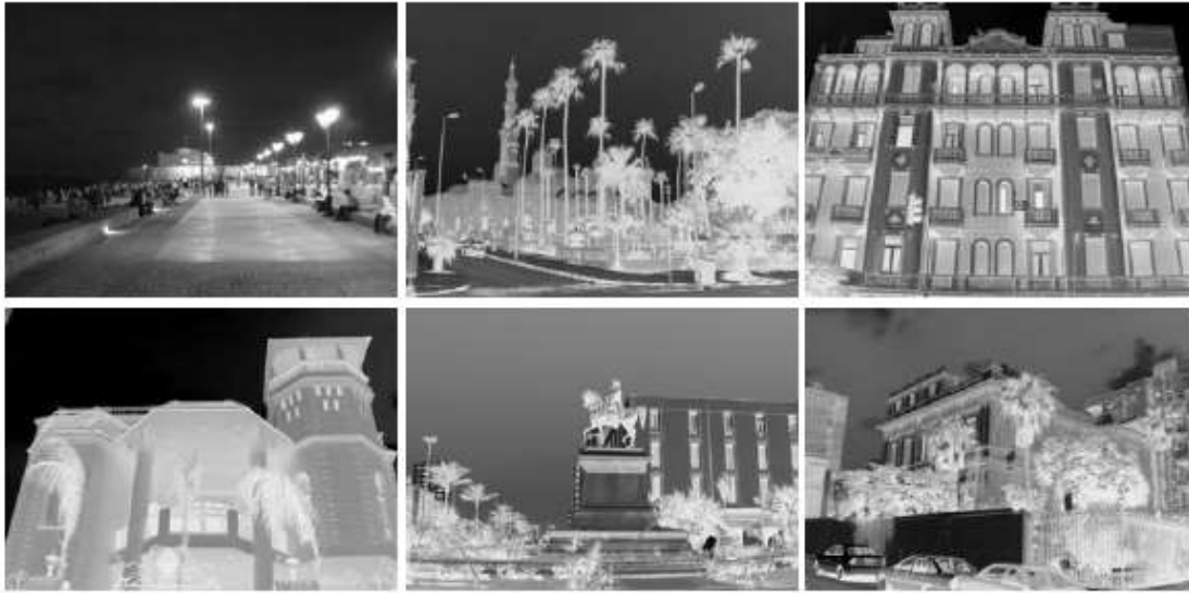
Figure (2) Alexandria Urban Fabric and Identity.