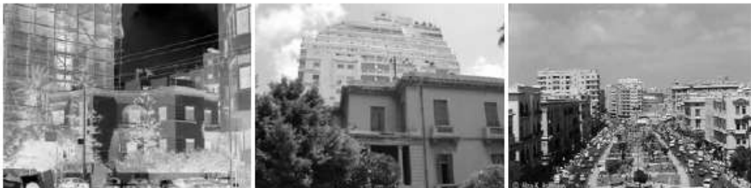
Figure (3) Examples showing the pressures on Alexandria City's Urban Landscape Fabric and Identity

Although the out product of this re-landscaping process might be satisfactory to the common people but, from our point of view the process lost track in taking the following aspects into consideration: