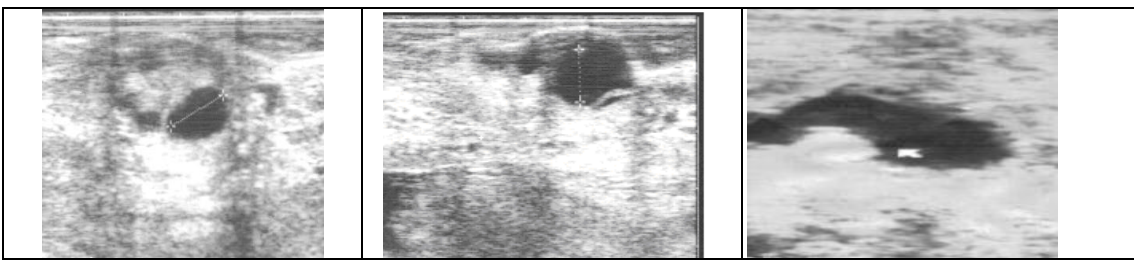
Plate (1): Ultrasonography examination of heifer treated with GnRH at insemination showing: ovarian follicle with 10.04 mm in diameter in conceived animal (A) and ovarian follicle with 9.00 mm in diameter in non-conceived animal (B) at insemination as Cwell as embry on day 35 postinsemination, indicating the incidence of pregnancy.

Price of each injection from GnRH and PGF<sub>2</sub>α was 20 and 12 L.E, respectively.