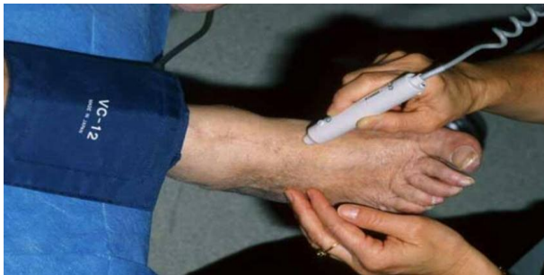
Fig. (2): ABPI assessment.

rushed to operating room. Emergent surgery was planned in each of them as soon as diagnosis was made. All the patients received IV broad-spectrum antibiotics at presentation to be directed later on according to culture and sensitivity. Full laboratory investigations and virology markers were done. Different diagnostic modalities were used for primary diagnosis and pre-operative assessment as duplex US, CT, CT angiography(CTA) and MRA in selected cases. In addition, bedside tests as Doppler signals detection, digital PO2 by pulse oximeter and ankle-brachial pressure index (ABPI) evaluation were done. Intraoperative assessment by intraoperative selective angiography if available and bedside tests. Postoperative and long term follow-up by clinical assessment, duplex US, CTA and bedside tests. Surgical strategies included: (a) Ligation of the affected arterial segment and debridement of all necrotic and infected tissue without revascularization that is preserved for patients who underwent primary ligation and experienced postoperative manifestations of acute ischaemia (b) Ligation and debridement with primary arterial revascularization.