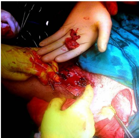
Fig. (5): Debridement of IFAP with necrotic femoral vessels.