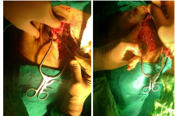
Fig. (7): Sartorius muscle flap procedure.