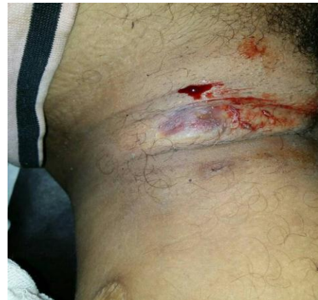
Fig. (1): Right infected femoral artery pseudoaneurysm with ongoing bleeding.

rupture arteries; secondly, to excise and drain the local septic tissue. Controversy exists as to which is the appropriate way to manage infected femoral pseudoaneurysm ligation or revascularization (2,8) . Trans-obturator bypass is a valuable option of revascularization so, vascular surgeons may need to become more familiar with this procedure and consider performing it in appropriate cases (9) .