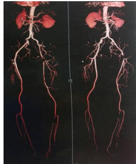
Fig. (4): CTA: left CFA injury due to injection.