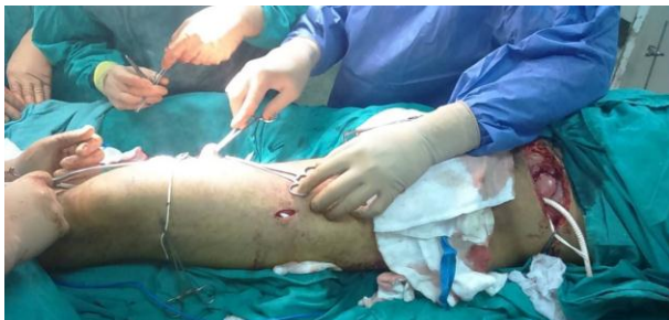
Fig. (6): Revascularization through ilio(CIA)-popliteal extra-anatomical lateral femoral bypass by PTFE synthetic graft.