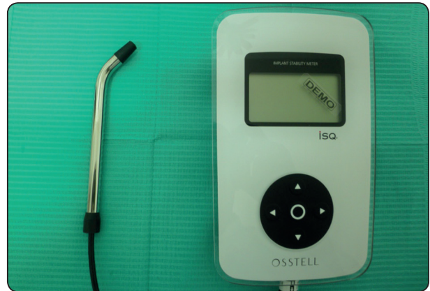
Fig. (4) Osstell ISQ Device

Cone Beam Computed Tomography [CBCT] images were acquired using the Scanora 3D System (Scanora® 3D, Sordex Co, Finland). The On-Demand software was used which allows the recording