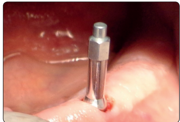
Fig. (5) Smart peg connected to the implant for ISQ measurement

of linear measurements of images. A tangential line was drawn at the apex of the implant perpendicular to the long axis of the implant. The bone height was measured from the apex of the implant to the crest of the alveolar ridge at the time of loading then after 3, 6, 12 and 24 months. The labial and lingual bone heights were measured on the sagittal view screen (fig.6), while the mesial and distal bone heights were measured on the coronal view screen. The mean value of readings of both mesial and distal together and buccal and lingual together was taken, tabulated and statistically compared.