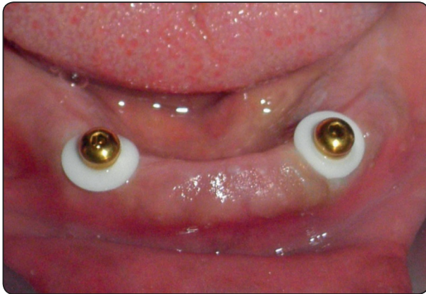
Fig. (3) Locator abutments with blockout spacer at time of loading

up to two year follow up period starting from the loading time for the resonance frequency analysis (RFA) analysis of implant stability and CBCT measurements of marginal bone loss around the implants.