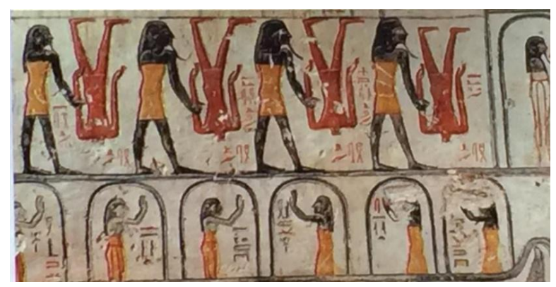
Fig. 4, Slaughtering-demons holding beheaded bodies of the damned from the tomb of Ramesses VI. After, SCALF, F.( 2017) Book Of The Dead, Becoming God in Ancient Egypt , Chicago, 58.