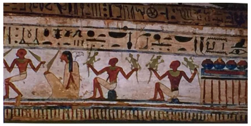
Fig. 3b, Representing guardian-demons holding traditional weapons such as knives and upstanding lizards depicted on the coffin of Horawesheb British museum EA 6666. After, SCALF, F.( 2017) Book Of The Dead, Becoming God in Ancient Egypt , Chicago, 134.