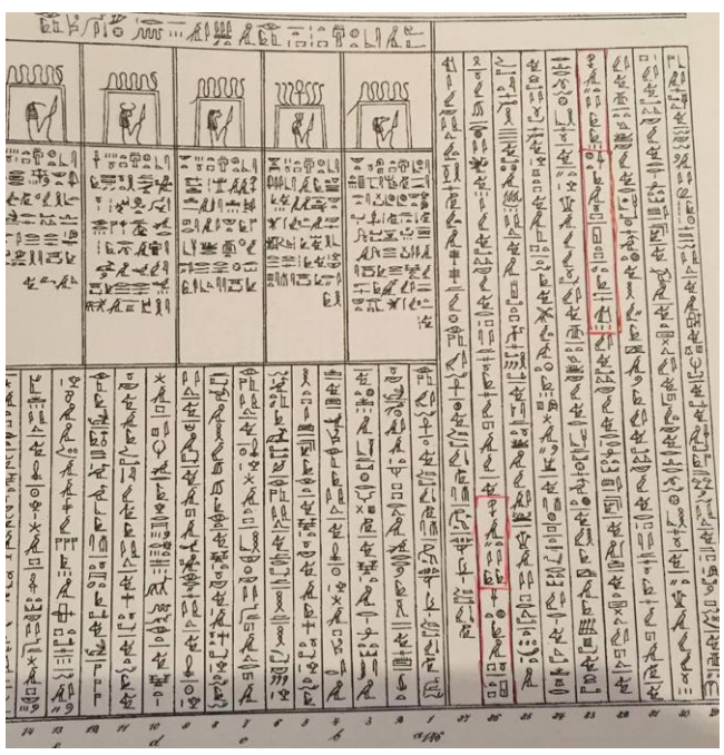
Fig. 5, Hieroglyphic texts confirming the close relationship between the slaughters and goddess Sekhmet. After, LEPSIUS, R., (1842) Das Todtenbuch der Ägypter nach dem hieroglyphischen Papyrus in Turin , Leipzig, pl. 65.82, 86.