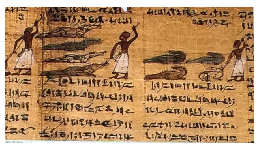
Fig. 10, representing ch. 31.of the Book of the Dead for driving off a crocodile which comes to take away the deceased's magic from him in the realm of the dead. After, SCALF, F.( 2017) Book Of The Dead, Becoming God in Ancient Egypt , Chicago, 114.