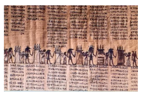
Fig. 2, Representing guardian demons in vignettes 146, 147 from the Book of the Dead. After, SCALF, F. (2017) Book Of The Dead, Becoming God in Ancient Egypt , Chicago, 236-237