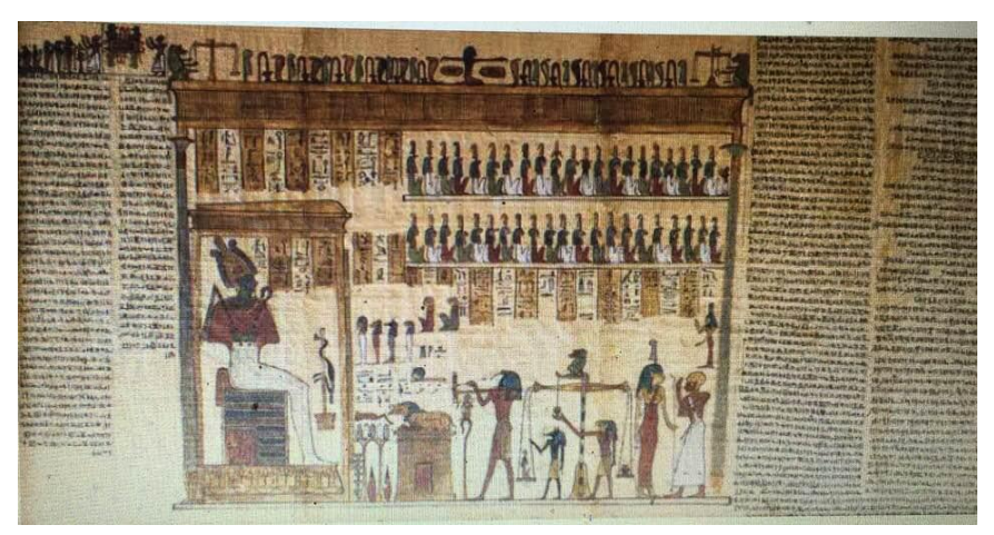
Fig. 8, Representing messengers who punish the sinful in the Realm of the Dead, vignette 125 of he Book of the Dead. After, SCALF, F.( 2017) Book Of The Dead, Becoming God in Ancient Egypt , Chicago, 81.