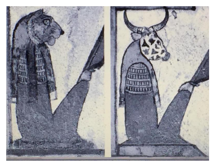
Fig. 3a, Representing guardian-demons in anthropomorphic forms with hybrid human-animal representations. After, WILKINSON, R.H. (2003). 'Demons', in The Complete Gods and Goddesses of Ancient Egypt , London, 81.