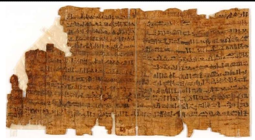
Fig. 7, A letter from a man to his deceased wife.