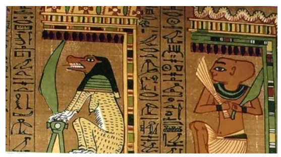
Fig. 1, Representing door- guardians from chapters 144 and 146 of the Book of the Dead. After, FAULKNER, R. (2010). The Ancient Egyptian Book of the Dead, Cairo , 134-135 and 138-139.