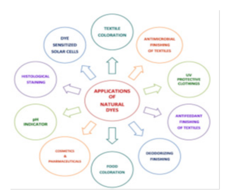
Fig. 1. Different uses of natural colourants.

New techniques for natural dyes' extraction for textile colouration: