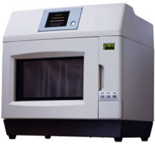
Microwave Extraction System