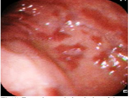
Fig(1):Extensive angiodysplasias of the corpus of the stomach.

masses, ulcers nor stricture; just sliding hiatus hernia. On examination of the stomach there were extensive angiodysplasias of the corpus of the stomach as shown in figures (1) and (2).