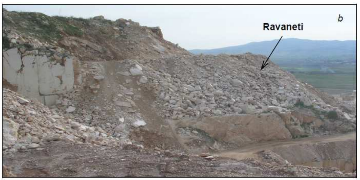
Figure 2 a-b: Ravaneti deposits, Custonaci (Trapani). The deposits is various granulometry.

The production of such waste is not uniform in the region - the mining activities are largely concentrated in localized areas and easily defined. We can estimate that in Sicily is an annual production of marble and stone equal at 900.000 - 1.000.000 t. These numbers is refer to the net production quarrying, net of the waste. In this sector the percentuals are very high with values around 70 - 75% (Custonaci marbles) of the extract material. So the bulk of the regional production of waste is concentrated in the Custonaci and that of a - still easily be assessed - the component lost as cut stone is already recovered for the production of aggregates for construction.