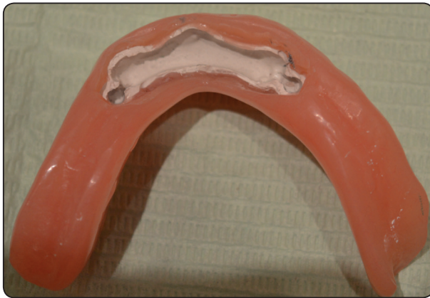
Fig. (5) Showing complete overdenture with female Acetal resin attachment.