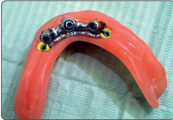
Fig. (4) Showing complete overdenture with female metal housing and elastic attachment and the bar with the distal male part of the attachment.