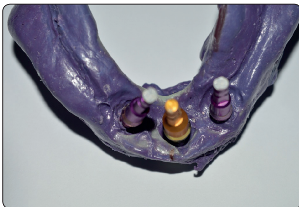
Fig. (1) Impression with transfer copings and implant analogues in place

The cast bar was scanned using bench laser scanner(smart optic) to obtain virtual model with the bar, the housing on the top of the bar and the female