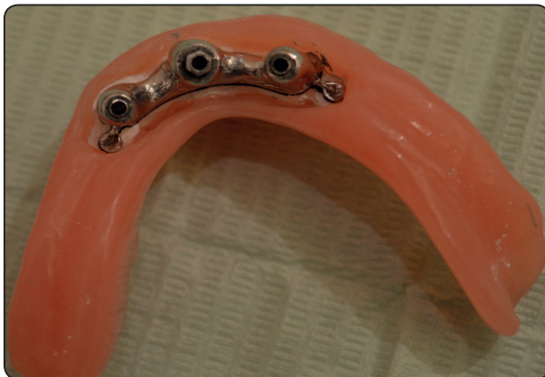
Fig. (6) Showing complete overdenture with female Acetal resin attachment and the bar with the distal male part of the attachment.

Jaw relation was registered and over dentures were constructed to all the patients following the same basic principles. Centric occlusion was developed at centric relation. Modified cusped acrylic teeth were used and balanced on semi-adjustable articulator for centric and eccentric positions following the medial positioned lingualized concept of occlusion. Prior to insertion, dentures were clinically remounted to refine the occlusion; to ensure free anterior contact in centric and free non-interfering contact during all excursive mandibular movements.