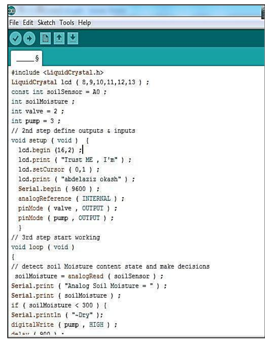
Figure. 4: Arduino software