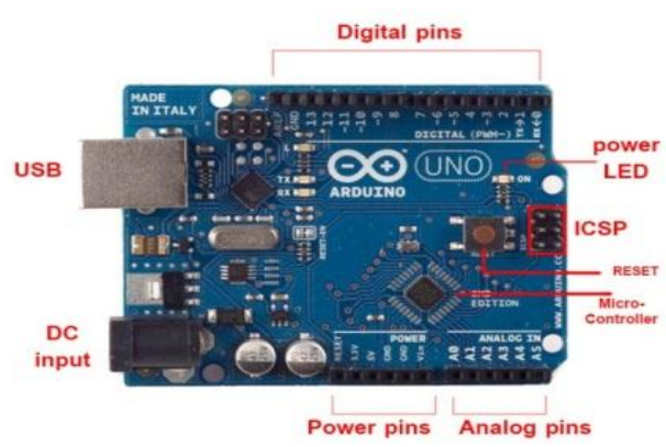
Figure2. Components of arduino board