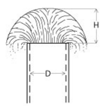
Fig. 1. Trajectory vertically method