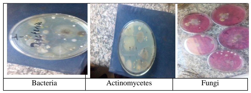
Fig. (3) Total microbial count cfu/ml (bacteria, fungi, and actinomycetes).

Table (9): Total count of bacteria, fungi, Actinomycetes and yeasts (cfu/gm/ml)