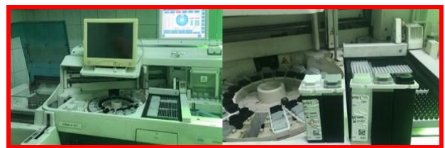
Fig. (3): Shows COBAS 4000 and kits of vitamin D.