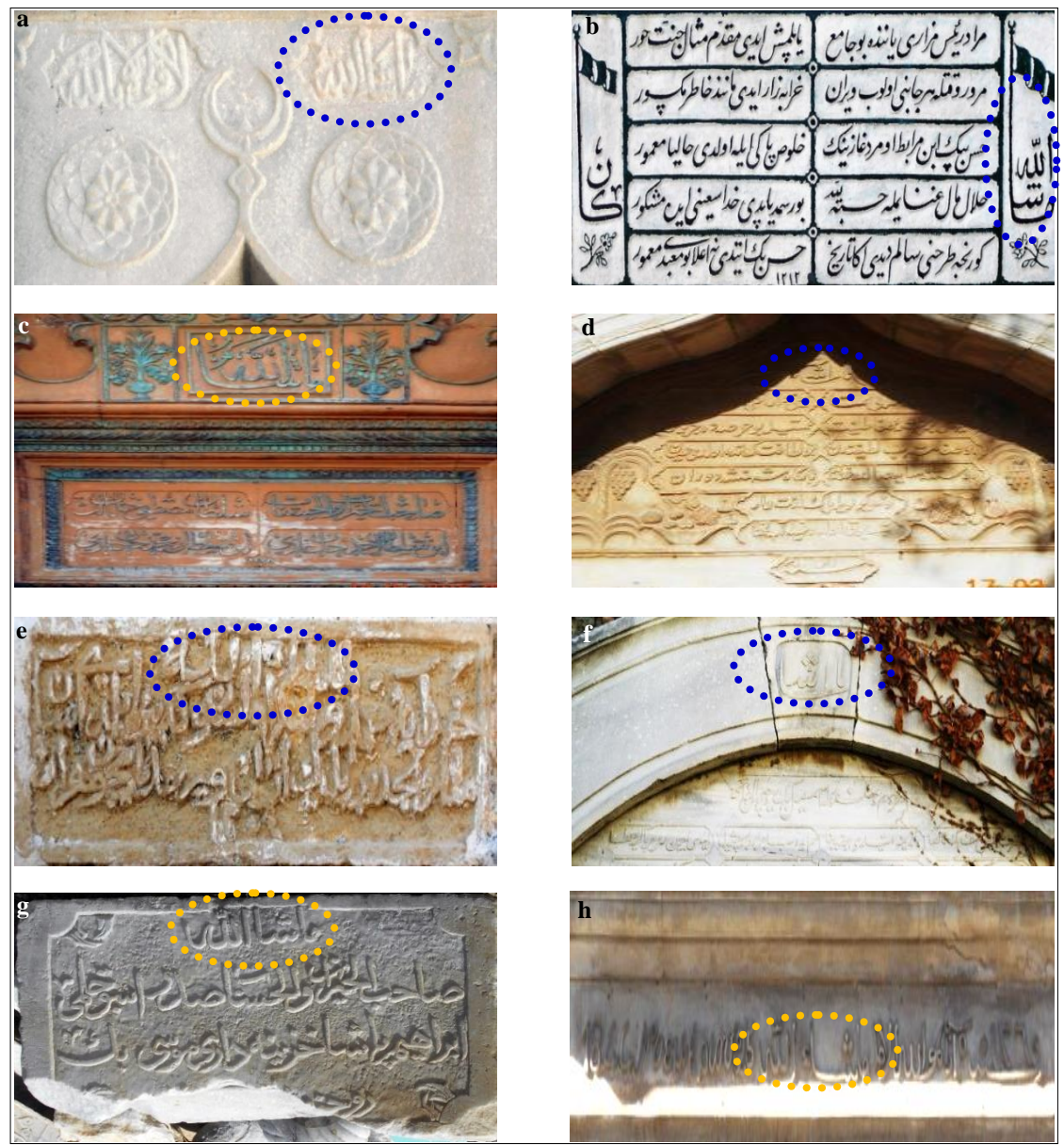
Figure (1) Shows <u>a.</u> inscription above the minaret's door of the Defterdar mosque at Kos, <u>b.</u> above the main door of Murad Reis mosque at Rhodes, <u>c.</u> above the main door of the Mustafa mosque at Rhodes (1178H/1764-65), <u>d.</u> one of the foundation inscriptions of the fountain of Melek Mehmed Pasha at Chios (1181H/1767-68), <u>e.</u> restoration inscription of the minaret of Veli mosque at Rethymno, Crete (1204H/ 1789-90), <u>f.</u> foundation inscription of the fountain of Youssef Bey at Serres (1230H/ 1814-15), <u>g.</u> (fountain?) of Mousa Bey found at the Turkish cemetery at Kremetis, Kos (No date), <u>h.</u>; house (154 Arkadiou St.) at Rethymno, Crete (1260H/1844)

Geographically, the majority of the 24 Mā shā Allāh building inscriptions are preserved in the Greek islands: five in Mytilini, fig<sub>s</sub>. (2-a,b,c,d,e), five in Crete (three in Rethymno, fig<sub>s</sub>. (1-e,h, 2-f), and one in Heraklio, fig. (2-g) and one in Chania above the exterior gate of Shaker Bey Aghazade mansion 19<sup>th</sup> c.?) [11], four in Rhodes, fig<sub>s</sub>. (1-b,c, 2-h,i), two in Kos, fig<sub>s</sub>. (1-a,g), and one inscription in Chios, fig. (1-d). The other seven are