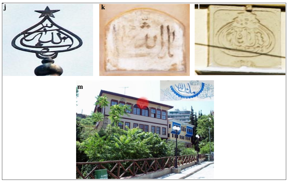
Figure (2) Shows <u>a</u>. Yali mosque at Mytilini (1151 H/ 1738-39), <u>b</u>. house in the village of Iscopelo, Mytilini (1288H/1781-82) (after ΜάκηςΑζιώτης, 2018), <u>c</u>. on the exterior façade of a shop almost in the mid of Ermou street at Mytilini (No date), <u>d</u>. above the portal of Yeni mosque at Mytilini (1241H/1825-26), <u>e</u>. the house at the end of Ermou street at Mytilini (1319H/ 1901-02), <u>f</u>. house no. 82 at Ethnikis Antistaseos St. at Rethymno, Crete (1312H/1894-95), <u>g</u>. Bektashi Tekke at Agios Vlasios village at Heraklio, Crete (1253H/1837), <u>h</u>. above the portal of Ibrahim Pasha mosque at Rhodes (r. 937H/1535-36), <u>i</u>. above the portal of Süleyman mosque at Rhodes (947H/1540-41), <u>j</u>. Eski mosque at Komotini, topping the dome (1017H/1608-09; most probably belonging to the 1270 H/ 1853-54 repair), <u>k</u>. on the interior facades of Mehmed 'Ali complex at Kavala (1236H/1820-21), <u>l</u>. inscription placed on the façade of a house in the city of Kavala, now is the youth center building, <u>m</u>. the mansion of 'Beka' at Veroia (mid 18<sup>th</sup> c.; restored in 1997-99)