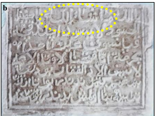
Figure (3) Shows a. & b. inscription on house in the village of Bastar near Tirana, Albania, 1270 H/1854