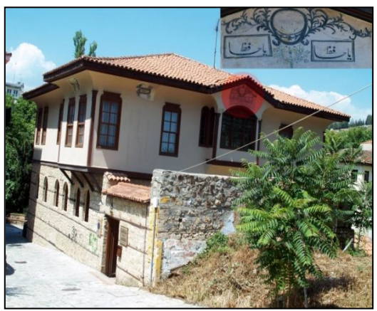
Figure (5) Shows the mansion of 'Beka' at Veroia (mid 18<sup>th</sup> c.; restored in 1997-99).

idering the position of the inscription, 2) the ratio between the dimensions of the inscription and the building or façade on which it is placed. 3) the position of the inscription on the exterior of the building. Evaluating to what extent the visual impact of the inscription is achieved by considering the abovementioned factors. The original state of the inscription and the building has to be taken into account equally. The paper further details two inscriptions among the examples presented above, considering the aforementioned factors, the 'Beka'mansion at Veroia, fig. (2-m, 5), and the two-storey house located in Ermou Street at Mytilini, fig. (2-e). The 'Beka'mansion at Veroia, fig. (2-m, 5) now houses the Institute of the Balkan Traditional Architecture and the Archive of Professor Nikolao Moutsopoulos. Thanks to the perfect restoration project undertaken in 1997-99, some of the house's inscriptions and decorations were preserved, two especially are of interest. The first is the 'Mā shā' Allāh' which is placed at the top centre of the façade overlooking the river, visible from all the corners. The second inscription is the phrase 'Yā Ḥāfiz', fig. (5) that is repeated twice within a rectangle, placed at the top centre of the main façade above the main door of the building from the courtyard, and visible clearly from the exterior at a distance, figs. (2-m, 5).