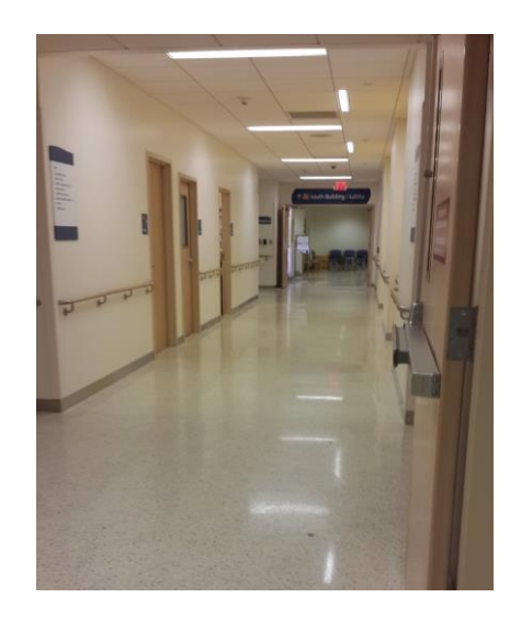
Figure 1 (Easy way finding & clear signs example form Children's Hospitals and Clinics of Minnesota)

• Is Conducive to a sense of well-being; that is "homely" (especially in long-term care), "attractive", "inviting", relaxing, with positive distractions in waiting and reception areas and an environment that facilitates autonomy and independence.