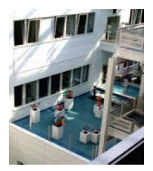
Figure 4(Even if courtyards are internal and do not receive much light, they can give a view out and contact with the outside, particularly if planting is provided)