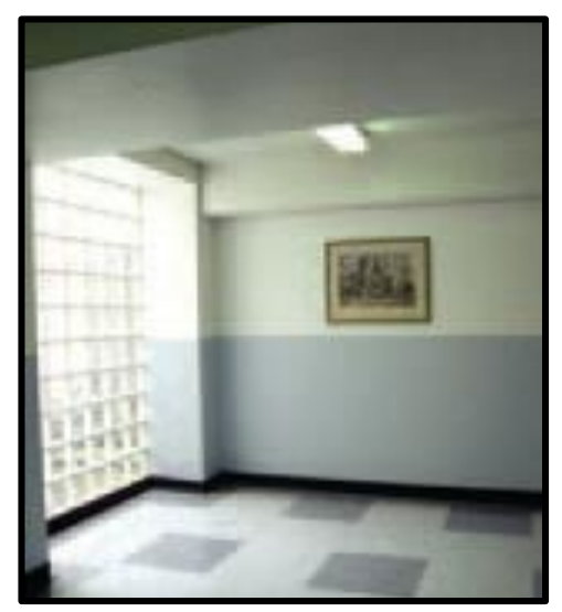
Figure 3(Daylight helps in clinical judgments while avoiding mixing daylight with artificial light is recomanded)

The following strategies should be done to help the daylight entering a building: