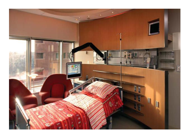
Fig 5 Adopt Room Headwall at the University of Minnesota Children's Hospital - Fairview, in Minneapolis, USA

These problems can be solved by a well-planned color scheme which bases the colors selected for the building on a wide range of criteria which color psychology theories cannot always cover. Some guidance is given below and in recommendations on the usage of color should also be applied carefully as over-use of a certain color can cause problems. For example, overuse of green or blue colors, renowned for their calming effects, in mental healthcare environments may actually exacerbate depression (check fig. 5)