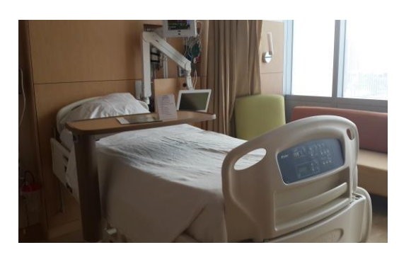
Figure 2(Daylight helps in clinical judgments while avoiding mixing daylight with artificial light is recomanded)