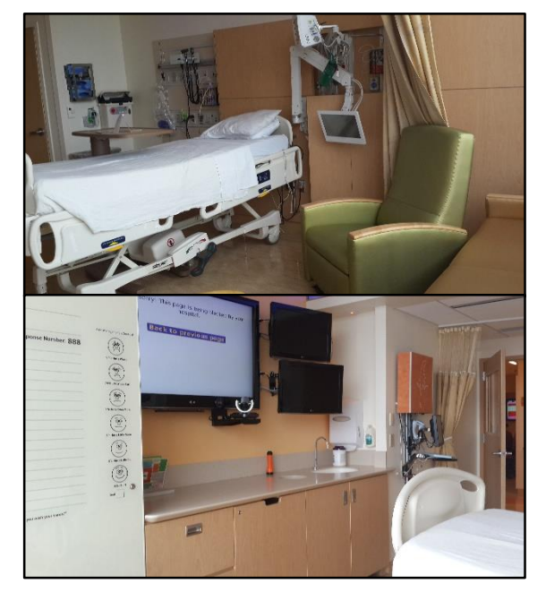
Figure 9 (case study interior shots)