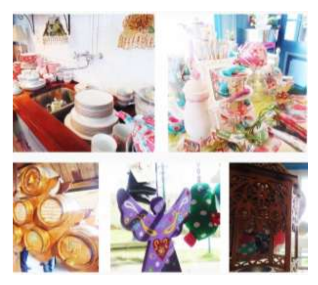
Figure 5: Handcrafts examples in Zaanse Schans. Zaanse Schans, 2014.

the biggest sales share of shoes over Netherlands with a selling rate of one pair of shoes every ten minutes.