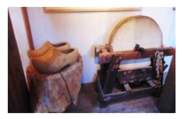
Figure 2: Tools for wooden shoes from 15th century. Zaanse Schans, 2014.

village. By late twentieth century, the village income was fully dependent on Dutch crafts. Where they make Holland cheese and wooden shoes and sell it in the international market. The village turned into a touristic destination that people travel to from all around the world. [18]