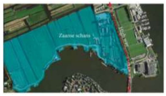
Figure 11: Zaanse Schans accessibility from main road. Ref: Zaanse Schans Cognitive map, 2014

A direct road from Amsterdam was built that can help in avoiding the main, more congested and heavy traffic roads. This road made it easier to access the village to tourists. It also served crafts there as it made it easier to connect to surrounding villages and areas, and easier to access materials needed for their production. Designated transportation was assigned to the village from railways and airport cities in addition to vital places in Netherlands. Which made it possible to include a day the village in many touristic programs in the country. [20]