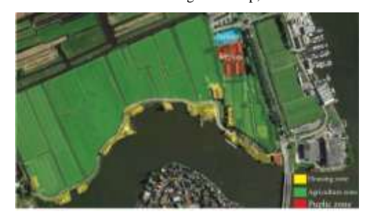
Figure 12: Zaanse Schans landuse layout. Ref: Zaanse Schans Cognitive map, 2014