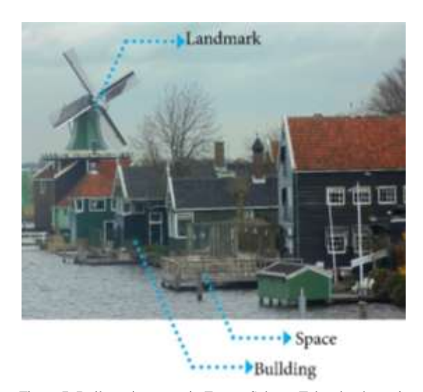
Figure 7: Built environment in Zaanse Schans. Taken by the main author, Zaanse Schans, 2014.

objective to preserve the unique heritage of the region. Similar construction materials were used, local resources, similar landscaping and landmarks. The area had around one thousand and one hundred windmills in the seventeenth century, only seven remained and one reconstructed that dates back to 1680. [17]