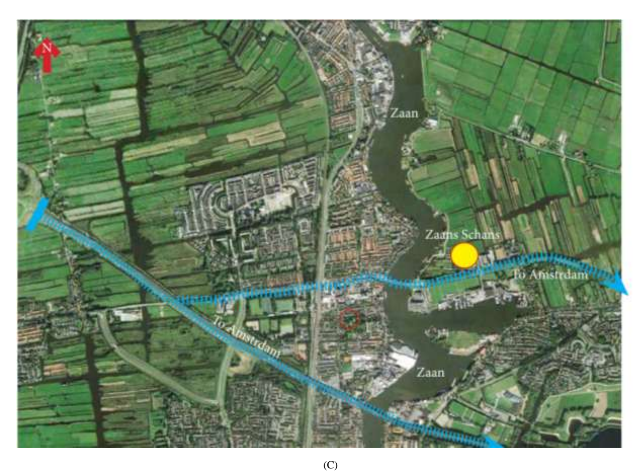
Figure 3 A, B and C: Netherlands map, Zaanse Schans location Ref. Google maps. Accessed on 2014.