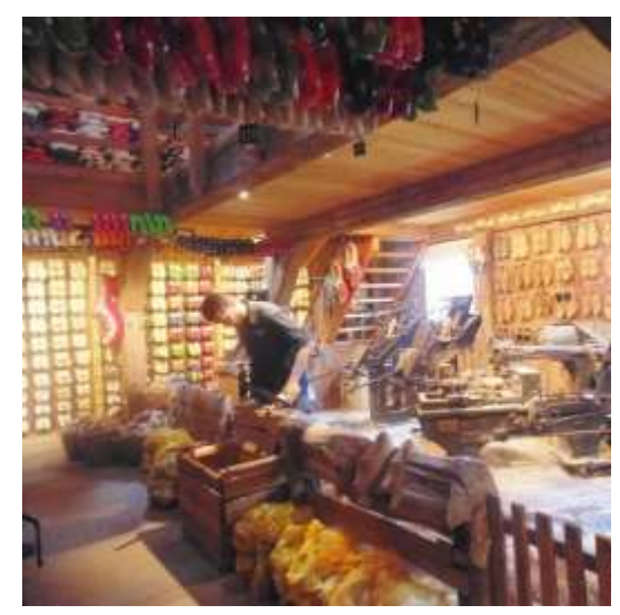
Figure 4: Klompenmakerij workshop and gallery in Zaanse Schans. Taken by the main author, Zaanse Schans, 2014.

There are several other crafts men and women practice over there like drawing, diamond cutting, ornaments makings, gold smith, and stroopwafel making. Every house specialized in a craft that acts as an open gallery and named by the craft done in it. (Tinnegieterij De Tinkoepel- Craft Centre De SaenseLelie - KuiperijTiemstra)