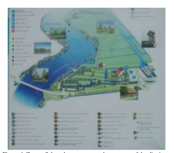
Figure 6: Zaanse Schans houses map on the entrance of the district. Zaanse Schans, 2014.

There are several other crafts men and women practice over there like drawing, diamond cutting, ornaments makings, gold smith, and stroopwafel making. Every house specialized in a craft that acts as an open gallery and named by the craft done in it. (Tinnegieterij De Tinkoepel- Craft Centre De SaenseLelie - KuiperijTiemstra)